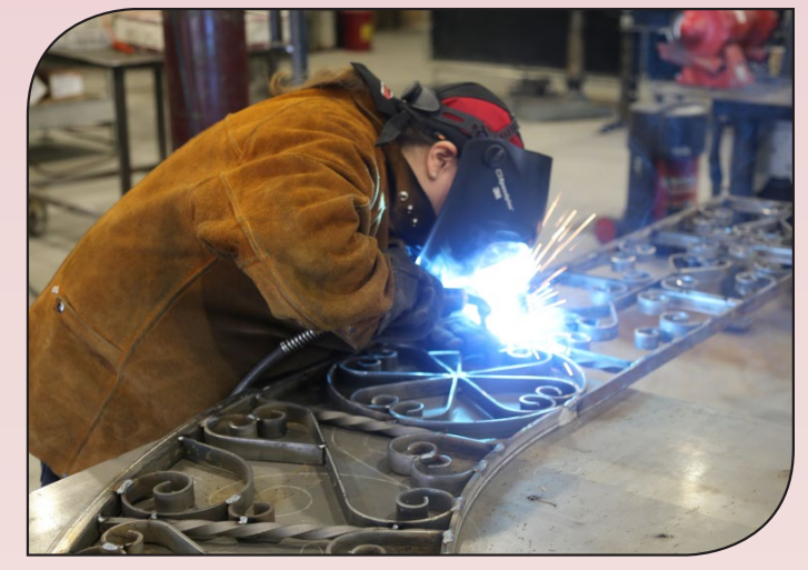
Neeginan College Welding Student

CAHRD provides holistic services to clients for job searching, education and training through individualized support services that include: