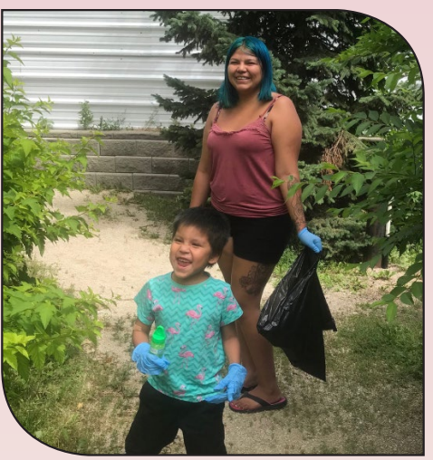
Neeginan Village Community Clean Up