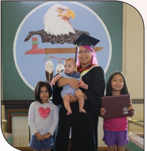
2020 Aboriginal Community Campus Graduate