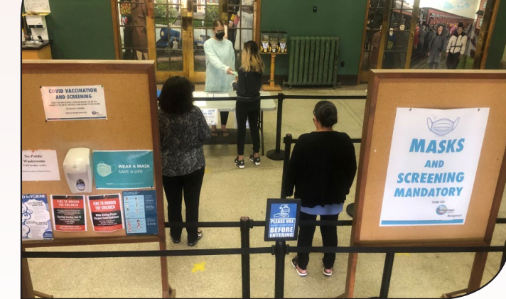
COVID Safety Screening